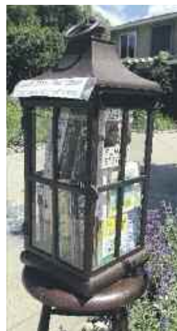
Moraga's Little Free Library on Larch.

Preston kept it simple, buying a large outdoor light lantern, mounting it on an old kitchen stool and setting